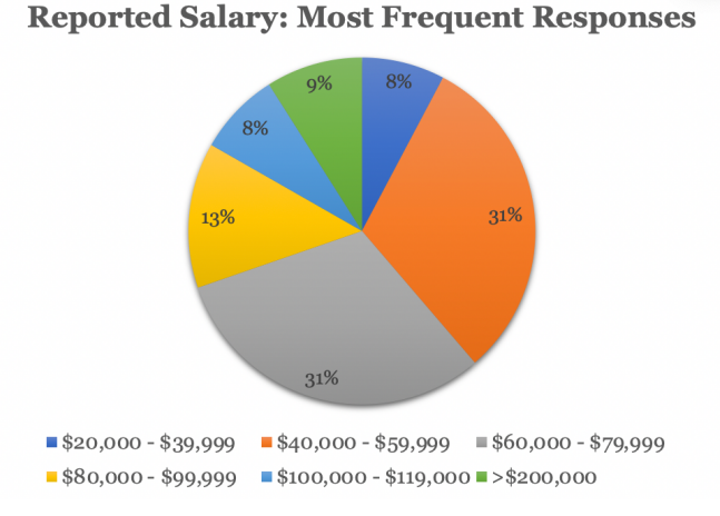
Table 2: Salary Ranges: Most Frequent Responses.